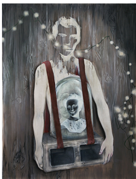
Self-contained Pedestal (Abuela Carola) , 2009 acrylic, graphite and spray-paint on mylar 43.5 x 27 inches