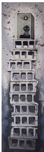
Pedestal 1 (mother) , 2009 acrylic, graphite and spray-paint on mylar 99 x 27 inches