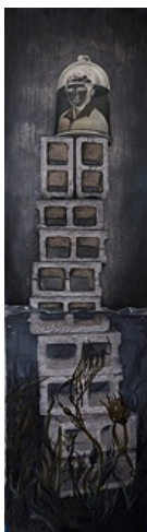
Pedestal 2 (father) , 2009 acrylic and graphite on mylar 99 x 27 inches