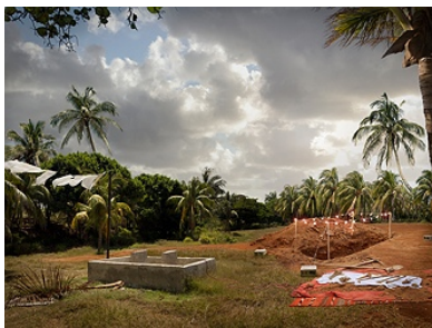
Sitio , 2009 color photograph, mounted on aluminum and laminated 40 x 53 inches Edition of 9